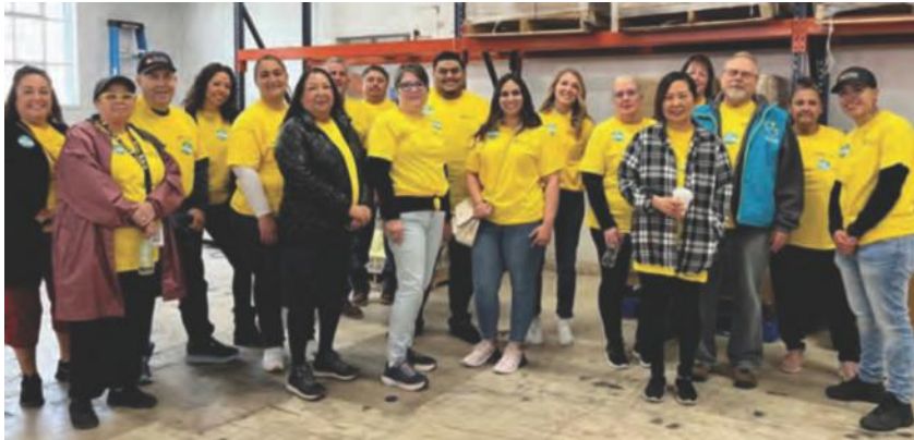
NM Gas Co. Volunteering at the Storehouse

We facilitate meaningful employee volunteer opportunities through our Shared Purpose initiative, supporting over 50 agency partners across five counties.