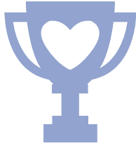
Recognition for Generosity