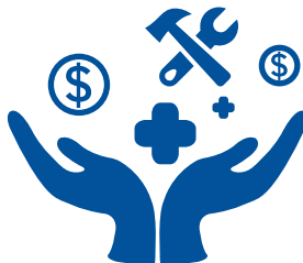
Increased Resources for Impact