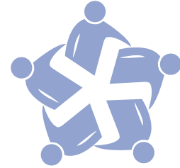
Build Teamwork and Innovation