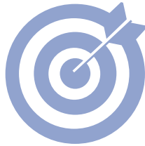
Achieve Social Responsibility Goals