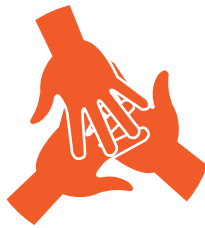
Joining Donors, Partners & Volunteers