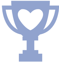
Recognition for Generosity