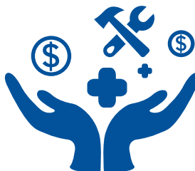
Increased Resources for Impact