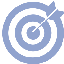
Achieve Social Responsibility Goals