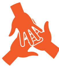
Joining Donors, Partners & Volunteers